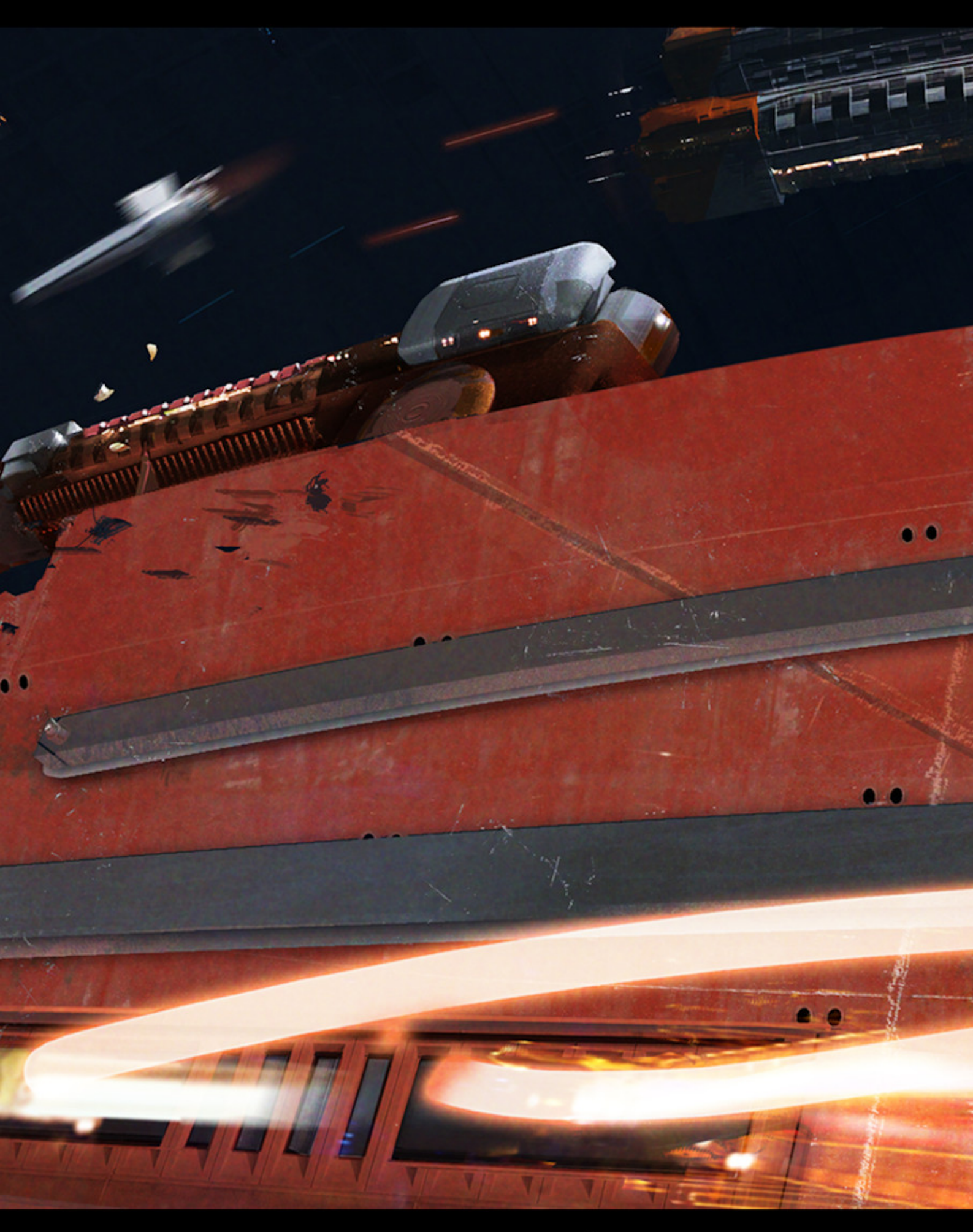
Serious Spaceship Drama