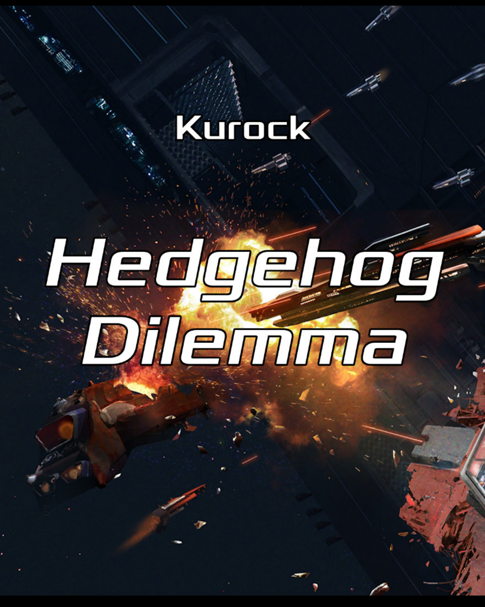
Dual Universe Fanstories